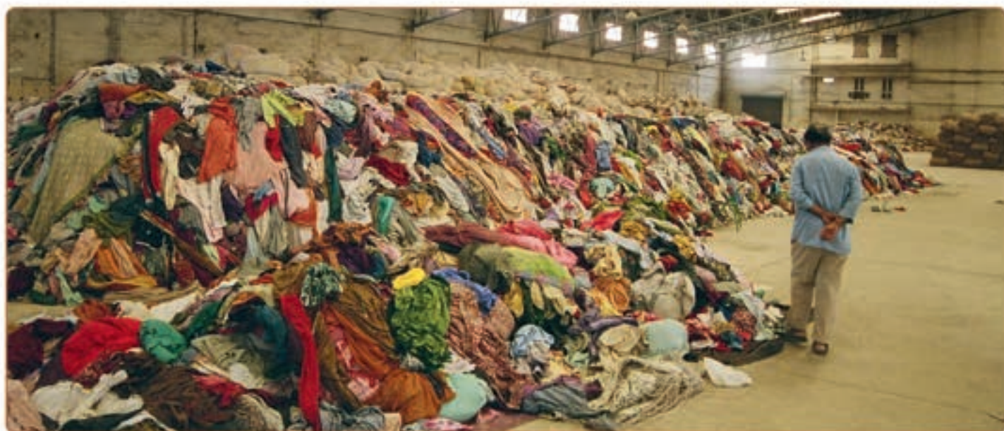
2004 picture of post tsunami clothes (Chennai warehouse)

Over the years Goonj teams based in the Goonj Chennai Center of Circularity have worked alongside communities during various disasters such as Cyclone Gaja, Cyclone Vardah, and the COVID-19 pandemic, 2022 Tamil Nadu Floods, and as recent as Cyclone Fenghal. In disaster response work, our focus has consistently been on transitioning disaster affected communities from charity based relief work to mobilising them to be their own decision makers and action takers to revive, repair and and develop their own broken ecosystems.