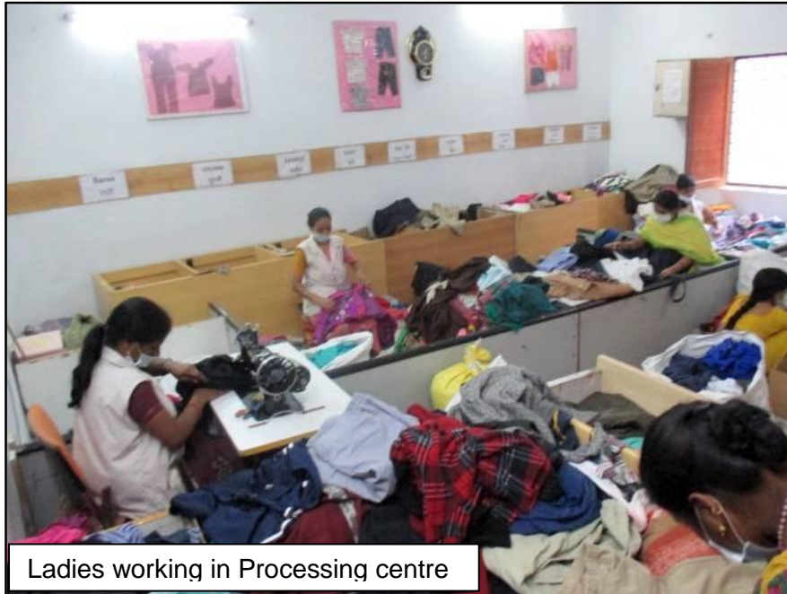
Ladies working in Processing centre

It's not an easy task for sure.. When you have a team of 300 plus with most under 30's.. Mental comparisons with the swanky offices of other well known organizations are bound to happen. What helps is when you see some of the senior most Goonj team members not having a permanent seat at all!! With so many people there is a need for